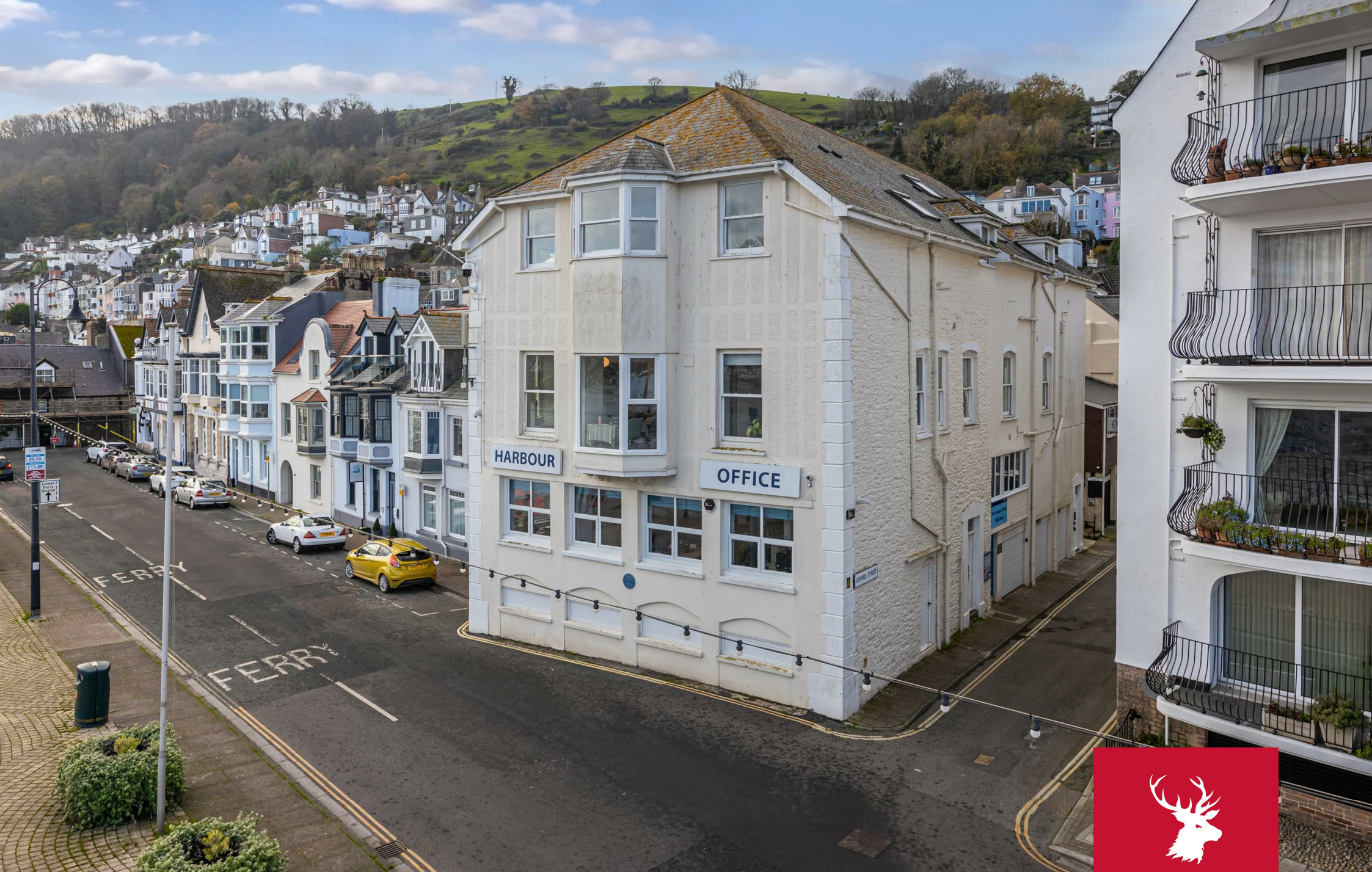
2 Dart House